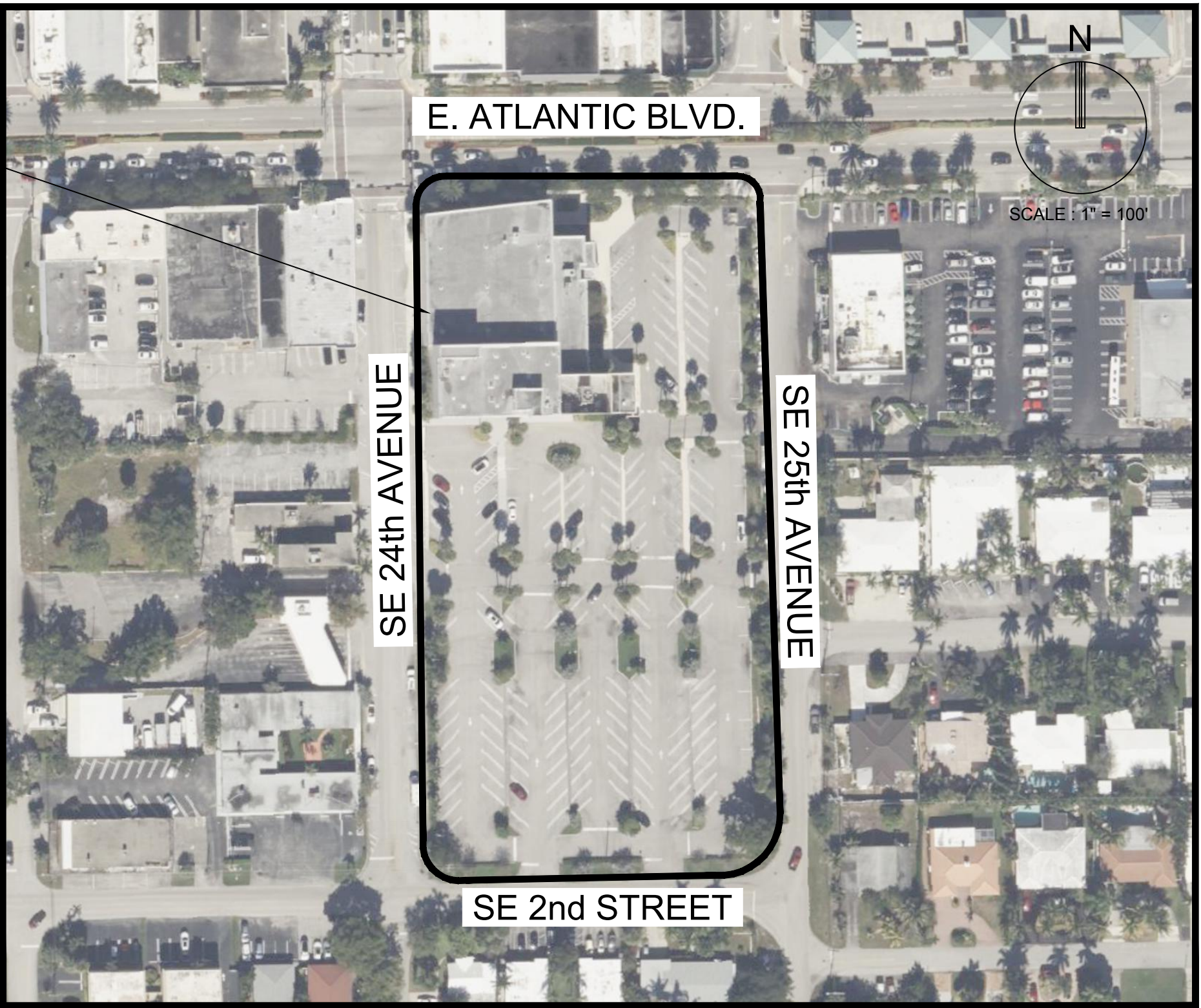
LOCATION MAP SECTION 05, TOWNSHIP 48 S, RANGE 43 E FOLIOS #484331050040, 484331050100

THESE PLANS MAY HAVE BEEN REDUCED IN SIZE BY REPRODUCTION. THIS MUST BE CONSIDERED WHEN OBTAINING SCALED DATA.